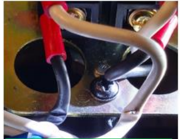
Kobalt Compressor Wiring Damage at Assembly