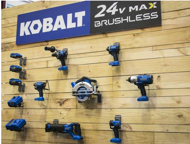
Kobalt Power Tools Phase 1