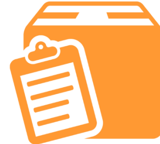
Pre-shipment PO Inspection