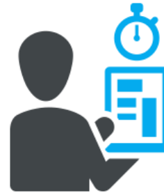
Product & Transit Testing